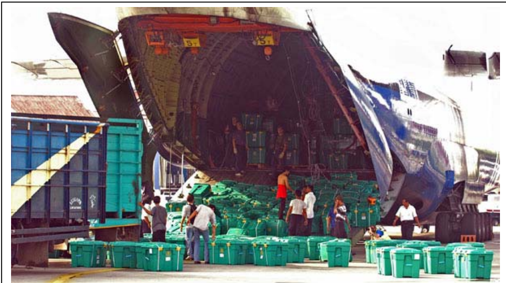
15/04/2005 Medan, Sumatra. 102 tonnes of Shelterboxes arrive in Polonia airport on an Anatov 124 aircraft for delivery to Oxfam for the Tsunami and most recently the earthquake victims in Nias and Aceh provinces in the Indonesian island of Sumatra.