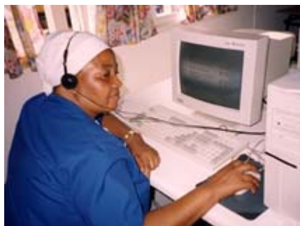
An adult student takes advantage of a computer-based literacy course, one of the project activities.

要紀念 7 月「扶輪識字月」Literacy Month，扶輪社可尋找方法協助弱勢社區居民學習閱讀與寫字。南非夸祖魯—那托爾 Literacy Month 省第 9270 個扶輪社所推動的「成人基礎識字計畫」Adult Functional Literacy Project，便是一個絕佳範例。