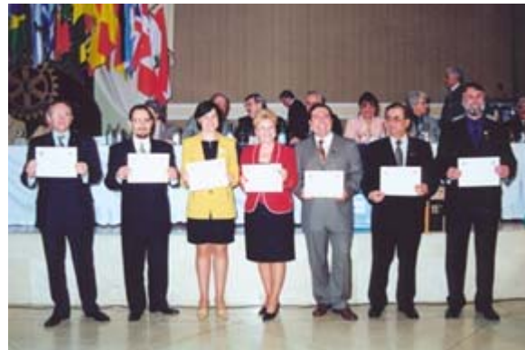
New members of the Rotary Club of São Paulo-Norte with certificates indicating their successful "graduation" from Rotary information classes.

Frustrated by its inability to grow by conventional methods, the Rotary Club of São Paulo-Norte, Brazil, took another tack. It turned to a public relations consulting firm for help in "marketing" Rotary to potential Rotarians — an idea that met with resounding success.