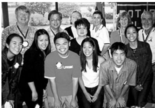
波德溫中學扶少團團員與威魯古扶輪社社員在討論服務活動的會議中合影 Baldwin High School Interactors and Rotary Club of Wailuku members during a meeting to discuss service activities.

World Interact Week, 4-10 November 2002, will mark the 40th birthday of the successful youth program, which began on 5 November 1962 with RI's certification of the Interact Club of Melbourne High School (Florida, USA). Today, Interact is a worldwide phenomenon, with 8,617 clubs in 107 countries.