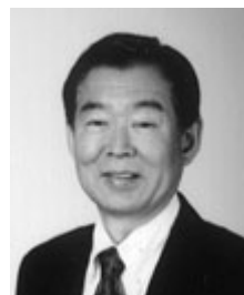
秘書長 Ed Futa

未來 2 年，扶輪社員將準備迎接扶輪歷史最重大里程碑之一：將於 2004-05 年一整年進行的扶輪百週年紀念活動。國際扶輪百週年紀念委員會已經集會數次，擬定一些大範圍的計劃，以增進大眾對扶輪與其 100 年服務的認識，並增進扶輪社及地區的參與。