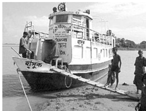
流動診所在孟加拉的班格拉帕拉附近停泊，以利病人看診。The Rotary Mobile Medical Clinic stops for patients near Bangla Para, Bangladesh.

The floating clinic meets a vital need, as no roads reach any of the villages and the area is flooded for five months during the monsoon season. Construction of the vessel was made possible by support from Rotary clubs in Bangladesh, Hong Kong, Japan, and Scotland, and a Rotary Foundation Matching Grant. Subsequent support, including Foundation grants, has helped